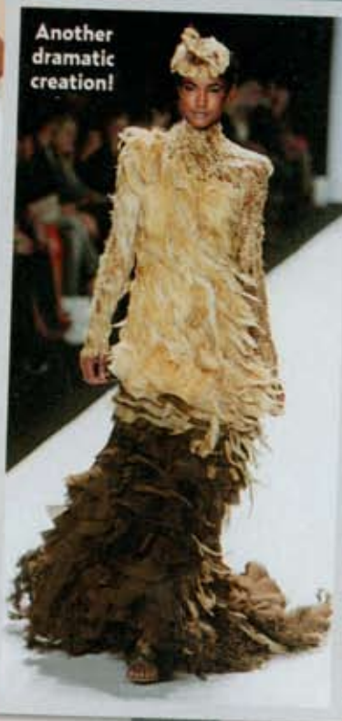
Another dramatic creation!

"I wanna dress Heidi at the Oscars next year!" says Siriano (with Klum on Feb. 8).